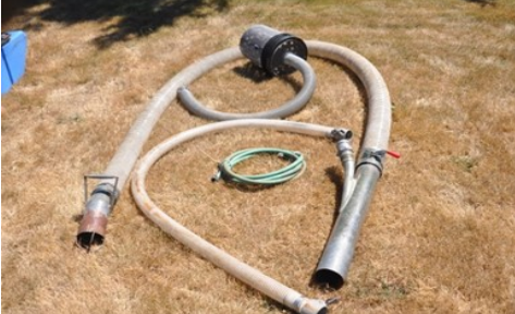
For Sate 4" Gold Dredge $1850.00

D&K Gold Dredge with Keene pump, Thomas Air pump, Dual air hoses with regulators and safety bottle. 6HP Briggs & Stratton engine, 17' of dredge hose,