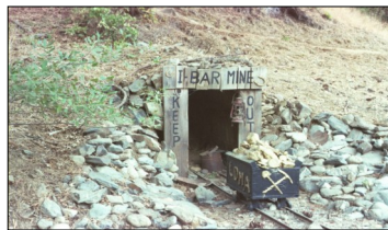
GPAA Italian Bar outing 2003