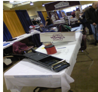
Our raffle prizes