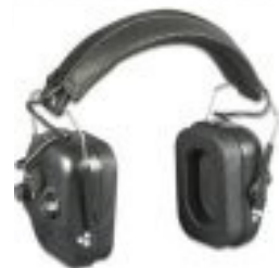
Foam Plugs and Ear Muffs