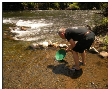
Panning in California May 2012

June 10, 2012 July 8, 2012 August 12, 2012 September 9, 2012 October 14, 2012 November 11, 2012 December 9, 2012